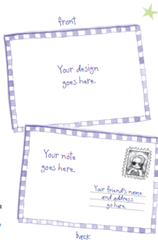
Based on the theatrical motion picture Judy Moody and the NOT Bummer Summer, produced by Smokewood Entertainment Group, LLC. Judy Moody®. Judy Moody is a registered trademark of Candlewick Press, Inc. Illustrations © 2010 by Peter H. Reynolds. Judy Moody text © 2003 by Peter H. Reynolds.

You can also make postcards just for fun (not mailable). Use the template on the next page to decorate your postcard. Be sure to design your own stamp!