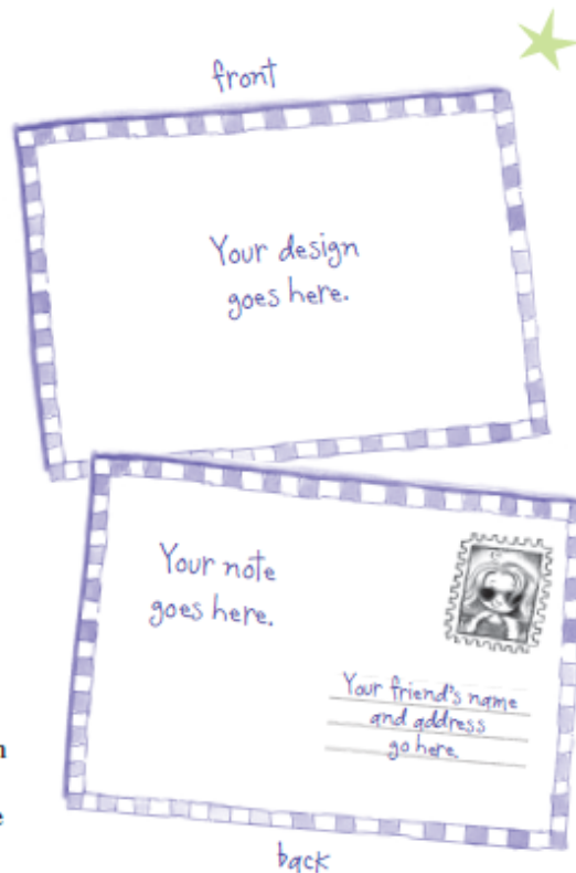
Based on the theatrical motion picture Judy Moody and the NOT Bummer Summer, produced by Smokewood Entertainment Group, LLC. Judy Moody®. Judy Moody is a registered trademark of Candlewick Press, Inc. Illustrations © 2010 by Peter H. Reynolds. Judy Moody text © 2003 by Peter H. Reynolds.

You can also make postcards just for fun (not mailable). Use the template on the next page to decorate your postcard. Be sure to design your own stamp!